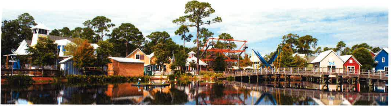
© Copyright 2018, The Village of Baytowne Wharf - Privacy Policy | Website Created By: Edge 4